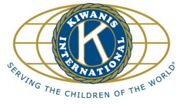
Kempenfelt Bay Club

Barrie Music Festival Association, 80 Bradford St., Unit 601, Barrie, ON L4N 6S7 (705) 726-1764 info@barriemusicfestival.com