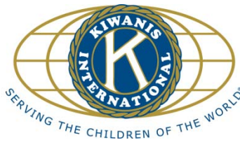
Barrie Club Golden 'K'